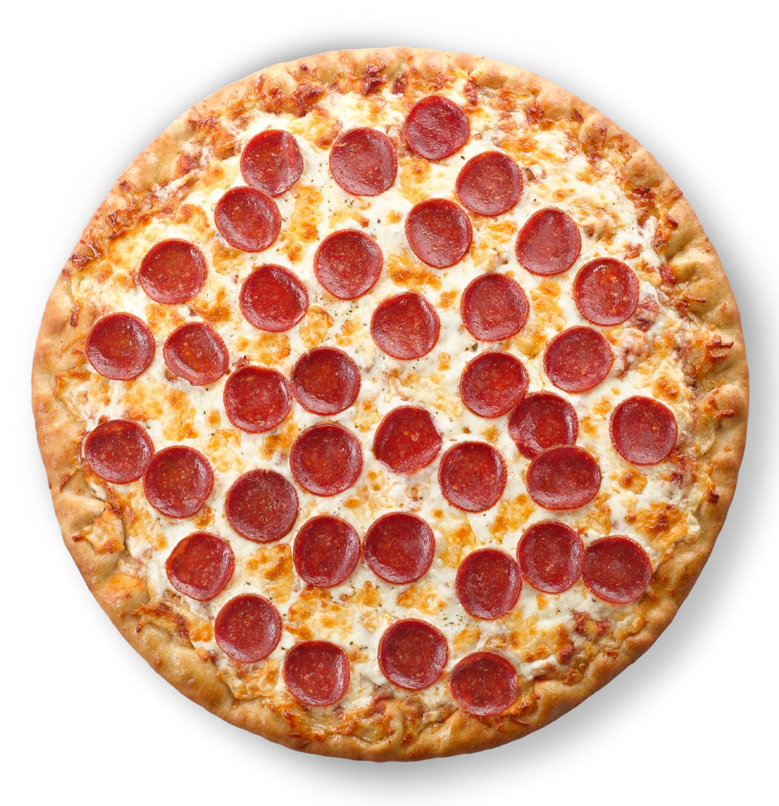
HIGHEST RATED PAR-BAKED PIZZA IN K12*