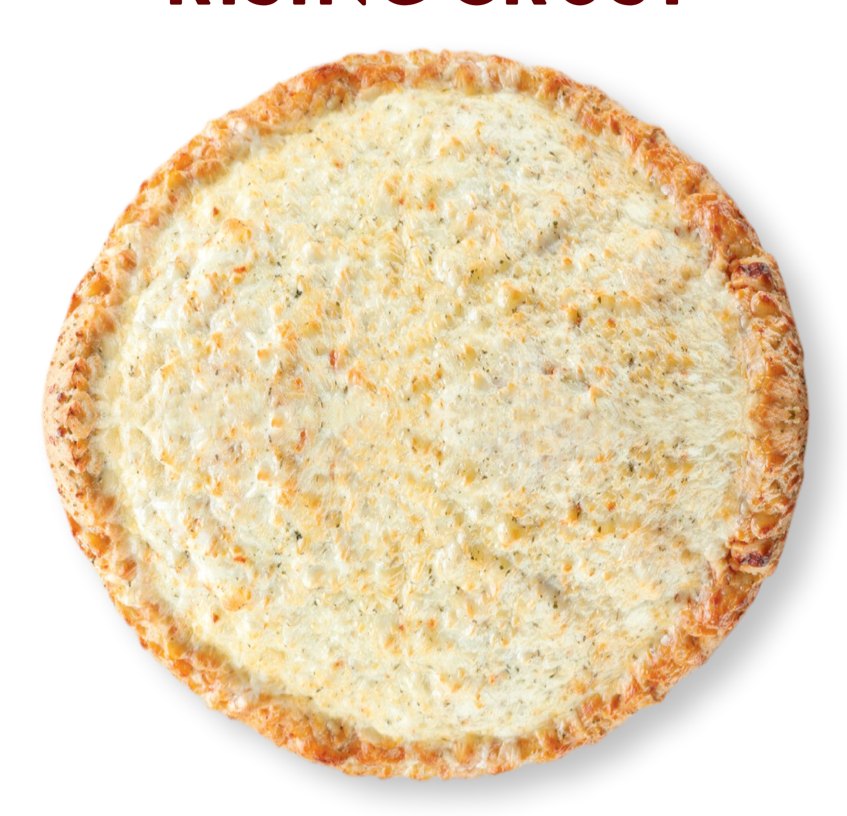
THE OVERALL #1 CHOICE IN SCHOOL PIZZA*