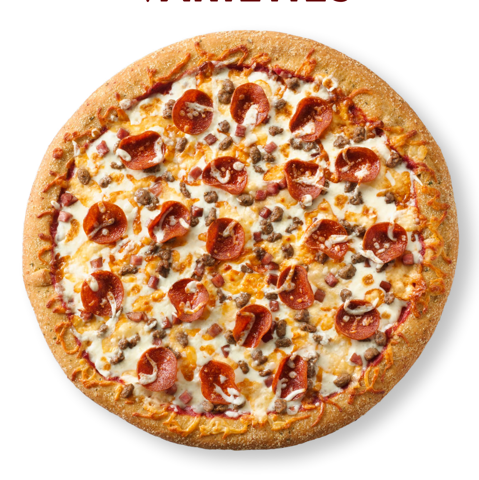
PROVEN FLAVORS KIDS LOVE